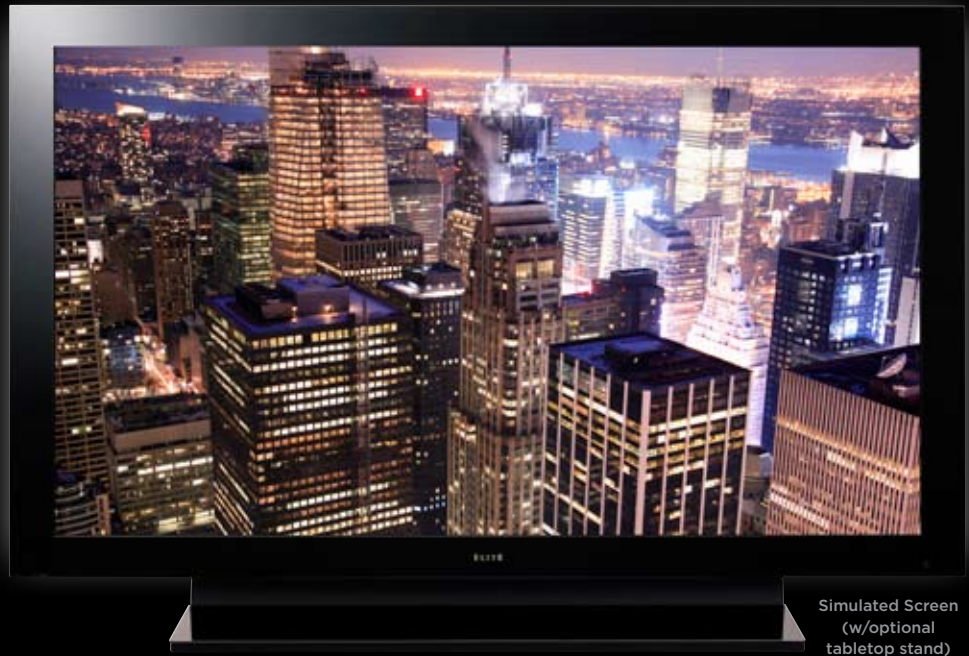
Simulated Screen (w/optional tabletop stand)

The Elite KURO signature series monitor represents the absolute pinnacle of Pioneer technology and craftsmanship. Meticulous attention to detail and pure unrivaled performance are just the beginning for custom installations. The signature series is the result of a special limited run created for the entertainment purist. This Elite KURO monitor was designed to excel in every way by providing extraordinary entertainment experiences for the most discerning of tastes.